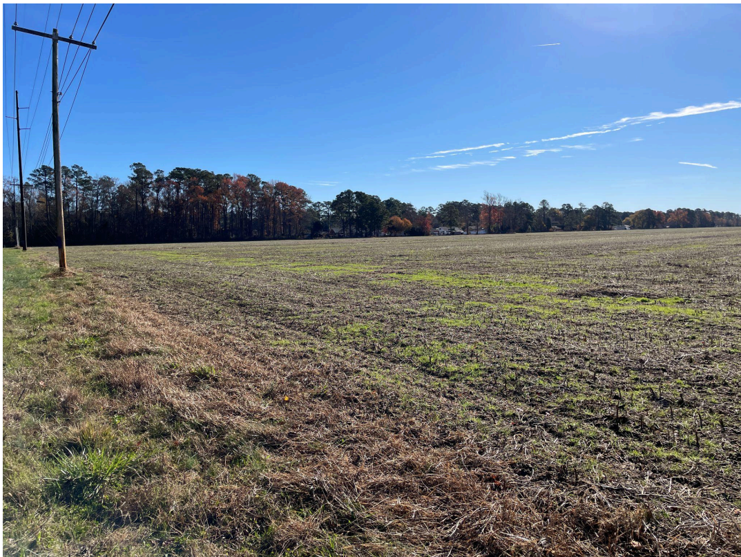
Figure 2. View of Project Site