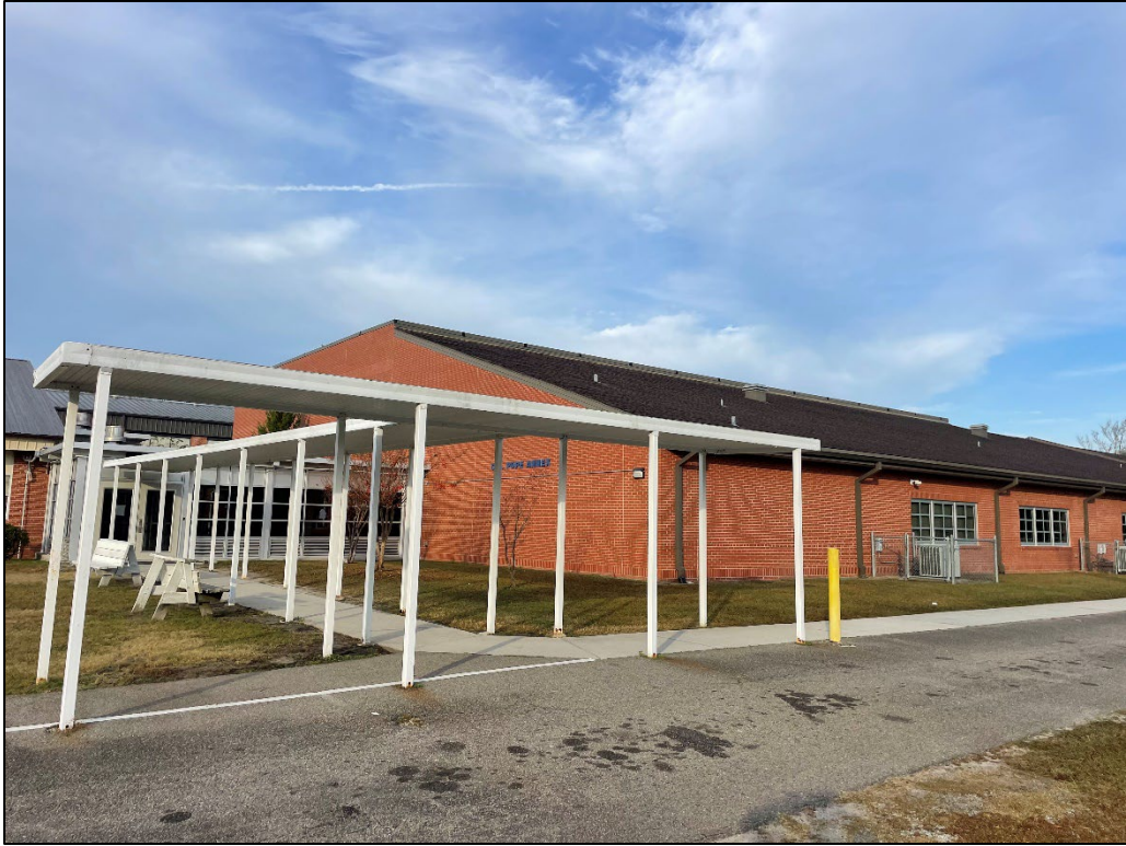
LEFT: view of eastern side of Annex/K-Wing building intended for use in this project.