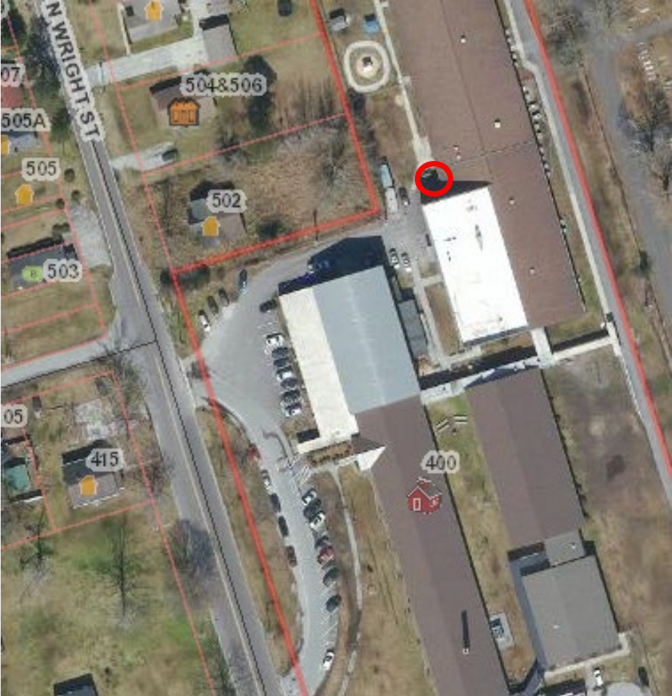
LEFT: top level view of C.F. Pope buildings. Building in top right of photo is Burgaw ES K-Wing. Circle in top left of building reflects location of current transformer and proposed location of new generator and automatic switch. The transformer will be moved to the new location as indicated to the left of the circle. This will be discussed at the