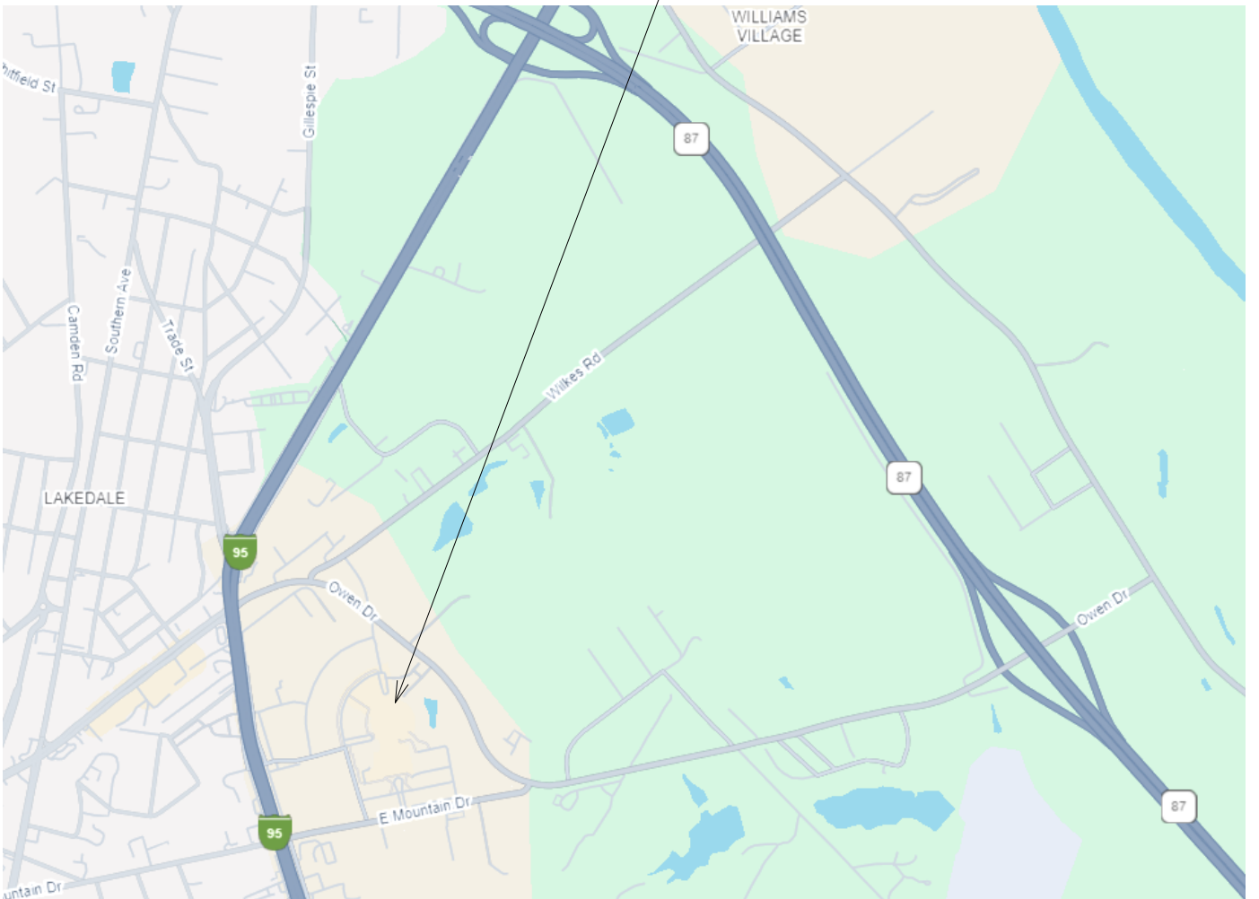
CHARLIE ROSE CENTER CUMBERLAND COUNTY CROWN COMPLEX 1960 COLISEUM DRIVE FAYETTEVILLE, NORTH CAROLINA 28306