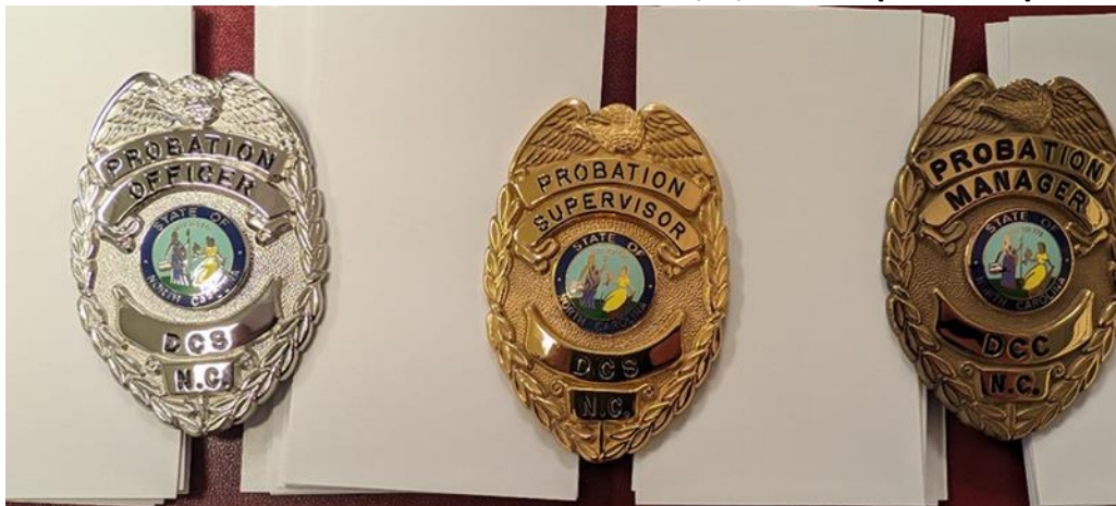
ITEM 1-SILVER OFFICER ITEM 2-GOLD SUPERVISOR ITEM 3-GOLD MANAGER