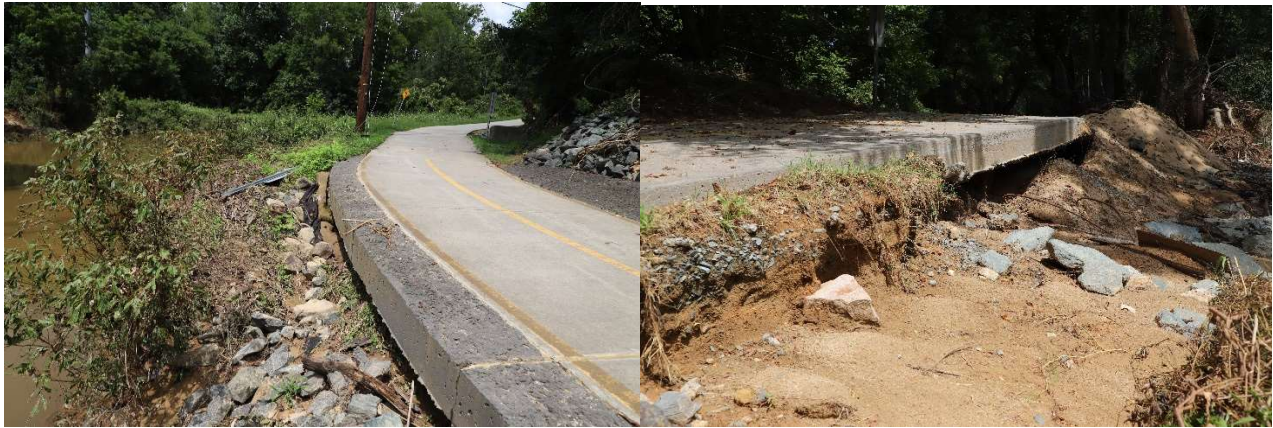
Sections along Morgan Creek Trail

Examples of the type of damage that occurred to the Town owned infrastructure and assets include: localized scouring under paved concrete and asphalt trails; erosion of streambanks; retaining wall damage; undermining of trail and sidewalk segments; degradation of abutment protections; compromised culverts, pipes, and inlets; damage to guard railings, trail railings, and protective fencing; loss of real property in highly utilized areas; as well as the disappearance of landscape material and overall natural aesthetics. See the photographs below for some examples of the destruction.