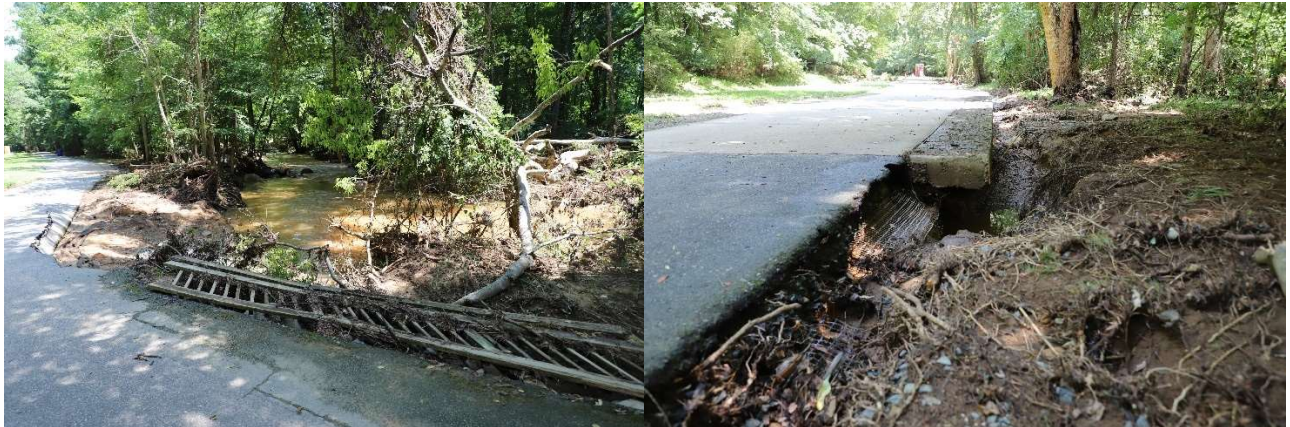
Sections along Bolin Creek Trail