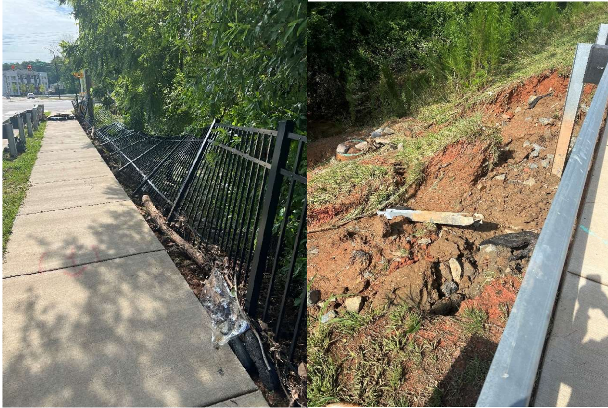
Sections along Booker Creek Basin Park

The Town is looking for a vendor that is familiar with the American Association of State Highway and Transportation Officials (AASHTO) standards for heavily used multi-use trails and has previously designed at least 5 miles of paved greenways on at least 5 separate greenways in urban areas for a North Carolina Municipality. The Town is looking for these repairs to re-establish safe trails that will be resilient to future flooding and storms. The Town of Chapel Hill has always been proud of its greenway system and looks to continue to highlight this attribute for years to come.