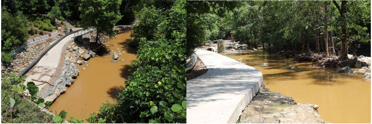
Sections along Bolin Creek Trail