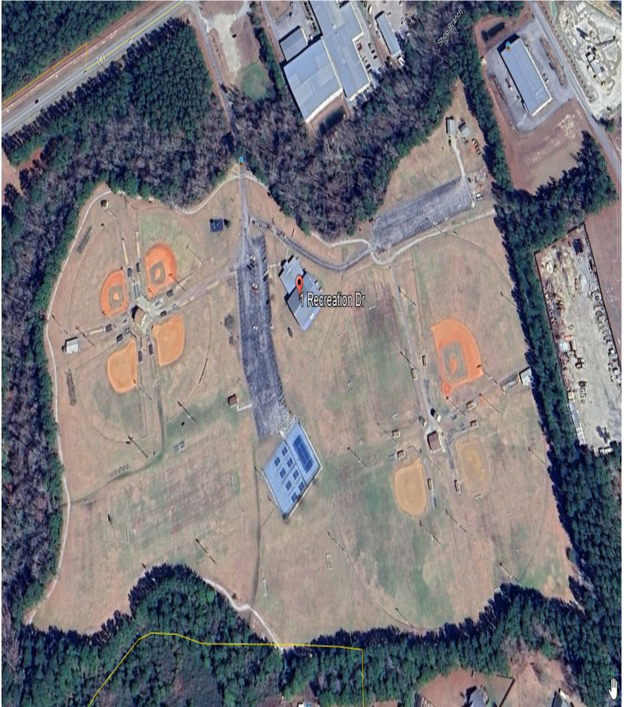
Figure 1: Work area map.