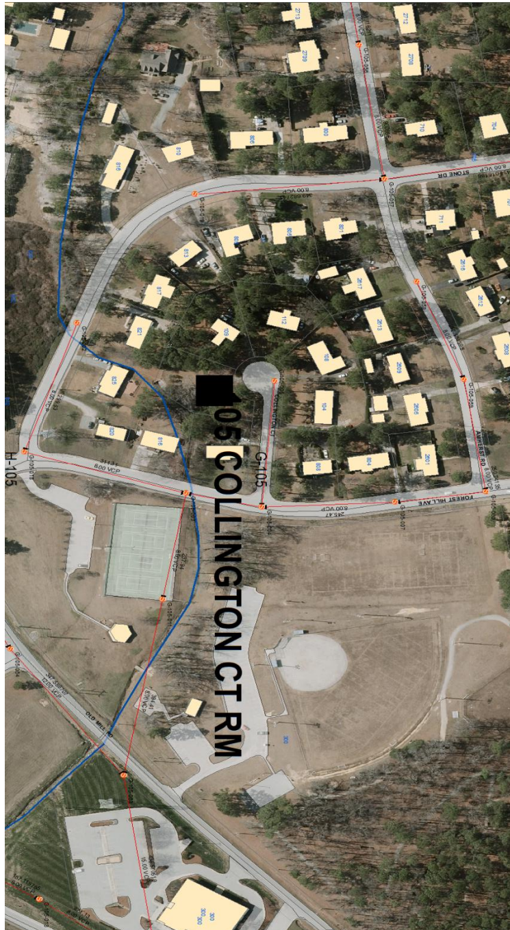
Amherst Road, Foresthill Avenue, and Collington Court

Plan sheets prepared by Appian Consulting Engineers, PA, are uploaded to the project bid file on the purchasing webpage in PDF form. https://www.rockymountnc.gov/Bids.aspx