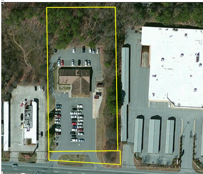
Winston-Salem S DMV

Initial contact with the coordinator is required before grounds work begins.