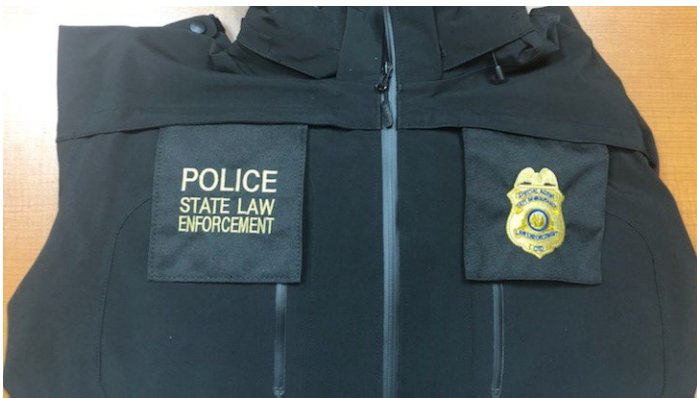
Front view of jacket