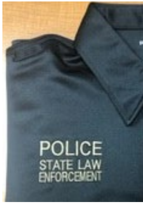
Left side of shirt