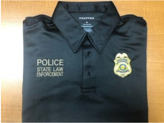
Front view of shirt

NC Department of Insurance, Fraud Control Group 3200 Beechleaf Ct. suite 810 Raleigh, NC 27604