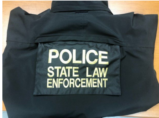
Back view of jacket