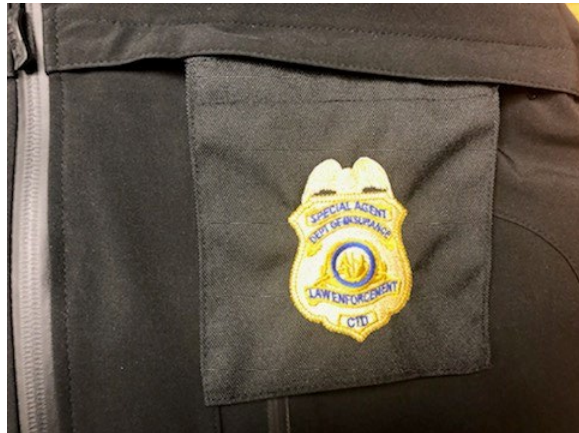
Right side of jacket