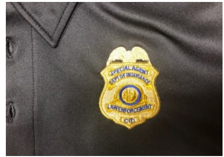
Right side of shirt