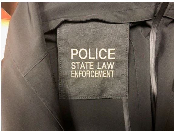
Left side of jacket