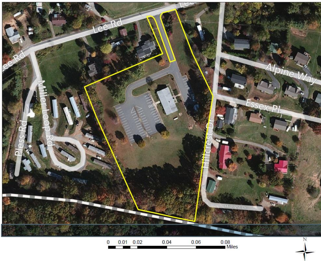
Clyde DMV: 290 Lee Rd

Initial contact with the coordinator is required before grounds work begins.