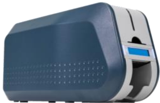
Featured product is CIX900 Single Sided ID Card Printer.

Please provide a quote for the items listed in the template below. This is a non-brand specific solicitation. The above referenced item is for comparison purposes only. All functional equivalents will be reviewed. If you are quoting a substitute model, please indicate such on your response. Substitute model must meet or exceed the quality and durability of the