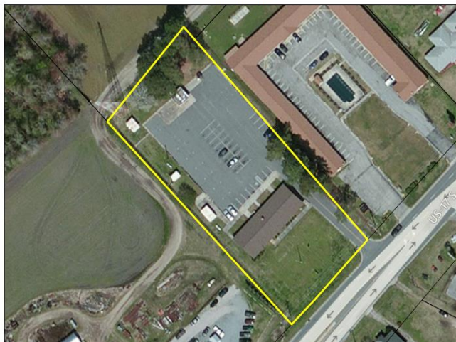
Elizabeth City DMV

Initial contact with the coordinator is required before grounds work begins.