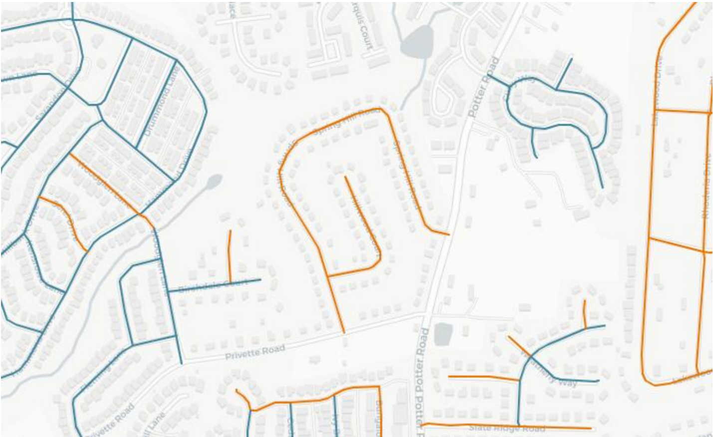
Roads Included: Springhill Road & Hillwood Court